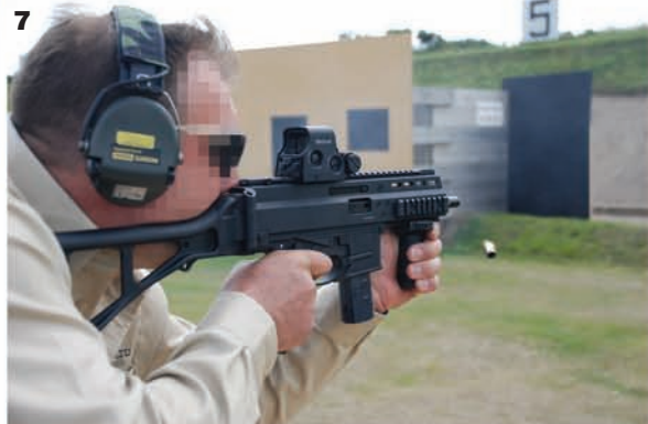
7: The ACP functioned with total reliability with the several different types of 9mm ammunition that we used

The others are specialists in international trading, freight and