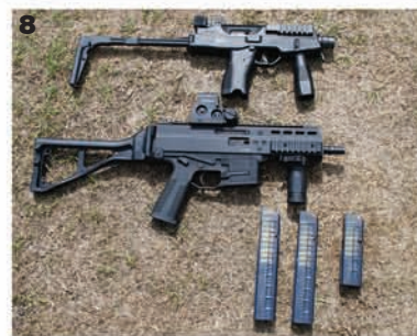
8: The compact MP9 and full sized ACP functioned reliably with the different capacity magazines