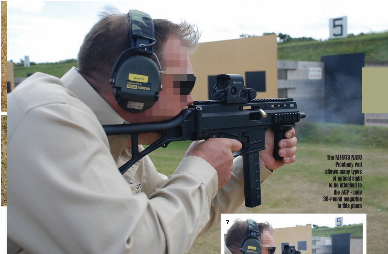
The M1913 NATO Picatinny rail allows many types of optical sight to be attached to the ACP - note 30-round magazine in this photo

for the mounting of a variety modern aiming and illumination accessories. The magazines are the same reliable and translucent 15, 20, 25, and 30-round items used with the MP9 PDW produced by B&T. The translucent magazines available are produced from a modern polymer and are impervious to all types of cleaning chemicals in common use.