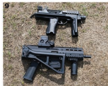
9: The folding butts on the full size ACP and compact MP9 versions make them both easy to carry concealed